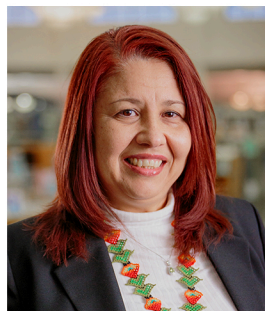
Ana Castro Preparatory Academy Principal Edinburg