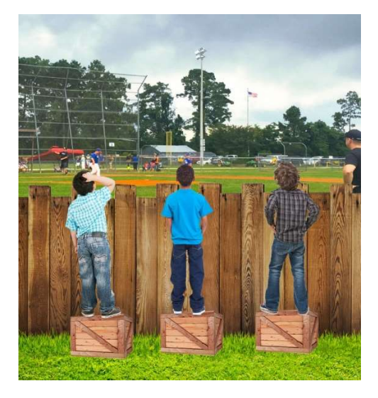
EQUALITY requires a level playing field that doesn't yet exist