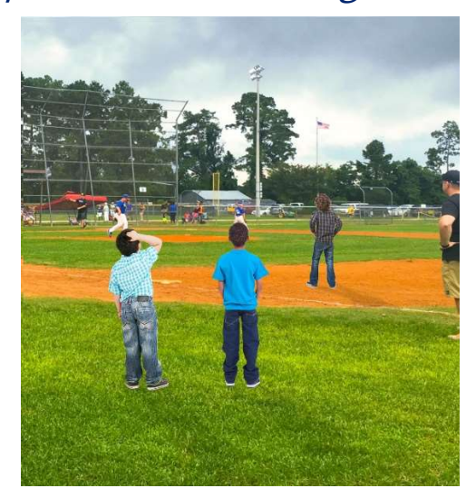
AGENCY individuals know that access is their right