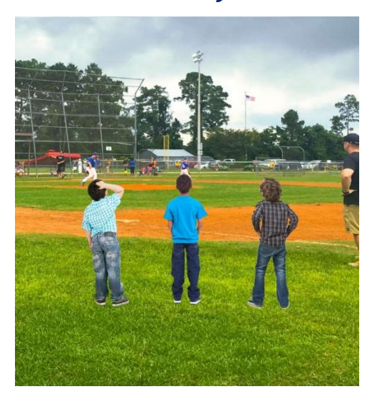
JUSTICE eliminates systemic barriers

The journey starts by asking those affected how they see and are impacted by the conditions, rules, and resources.