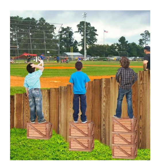
EQUITY acknowledges systemic impediments with targeted fixes

The journey starts by asking those affected how they see and are impacted by the conditions, rules, and resources.